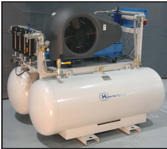
Left: HMP-B10-15 turnkey nitrogen booster skid, mounted on receiver tanks with high pressure filtration

*Nitrogen flow listed in SCFM, assumes typical booster inlet pressure of 100 psig, and outlet pressure of 545 psig."